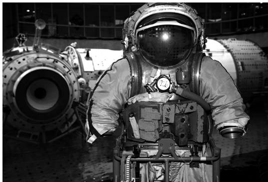
Space Walk Training Facility – Russia