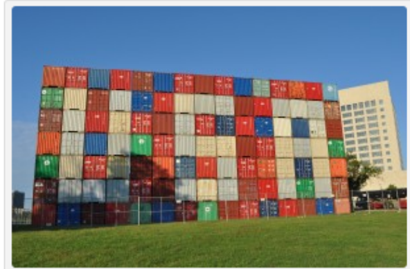
"IOU/USA," an exhibit across Federal Reserve Bank of Kansas City in Memorial Hill Park, is a seven-story exercise in political irony.